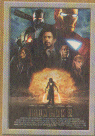
IRON MAN 2 (MAY 7, 2010)

At the end of Iron Man , Tony Stark had just revealed his identity as Iron Man to the world. Now everyone from vengeful super-scientists to the U.S. government is gunning for a piece of ol' Shell-Head. Luckily, he's got some old and new friends in War Machine and the Black Widow watching his back when the bullets start flying.