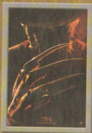
A NIGHTMARE ON ELM STREET (APRIL 30, 2010)

FLIPsideFLIPsideFLIPsideFLIPsideFLIPsideFLIPsideFLIPsideFLIPsideFLIPsideFLIPsideFLIPsideFLIPside