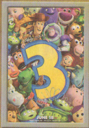
TOY STORY 3 (JUNE 18, 2010)

FLIPsideFLIPsideFLIPsideFLIPsideFLIPsideFLIPsideFLIPsideFLIPsideFLIPsideFLIPsideFLIPside