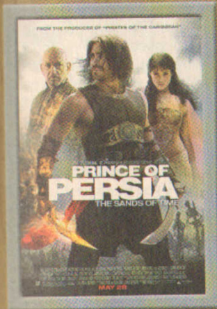
PRINCE OF PERSIA: THE SANDS OF TIME (MAY 28, 2010)

FLIPsideFLIPsideFLIPsideFLIPsideFLIPsideFLIPsideFLIPsideFLIPsideFLIPsideFLIPsideFLIPsideFLIPside