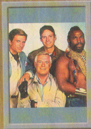
THE A-TEAM (JUNE 11, 2010)

If you have a problem, if no one else can help, and if you can find them... well, you know the rest! A revamp of the classic '80s TV show, this version of The A-Team seeks to up the stakes with some of the most outrageous action sequences of the summer!