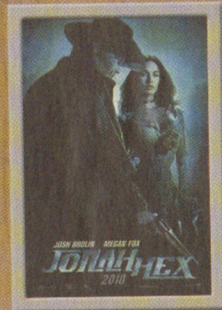
JONAH HEX (JUNE 18, 2010)

Remember those old westerns where the good guys wore white, had chiseled good looks, and stood for truth and justice? That ain't Jonah Hex; he wears a confederate army uniform, has a mangled face, and will only let you live if the bounty calls for it. He's all we got, so God help the bad guys.