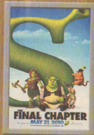
SHREK FOREVER AFTER (MAY 21, 2010)

Happily ever after isn't all its cracked up to be. Shrek has it all: a loving wife, darling children, and the admiration of his fellow fairy tale creatures. But he longs for his life as a single man, and makes a deal with the mischievous Rumpelstiltskin for a day to himself. But Shrek fails to read the fine print, and wakes up in a world where he was never born, and Rumpelstiltskin is king of Far, Far Away! Now Shrek has to fight for his Happily Ever After all over again!